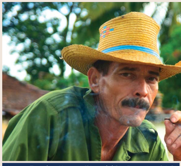
June 7, Tuesday: Havana /Pinar del Rio Excursion B,L,D

Depart for a full day excursion to the western part of Cuba where dramatic limestone peaks tower above verdant valleys. This region is known for its rich soil where almost all of Cuba's tobacco is grown. Drive along one of the new roads in Cuba to the town of Pinar del Rio, stopping en route at the Orchid Farm at Soroa. The hilly grounds contain over 800 species of plants all thriving in the humid climate.